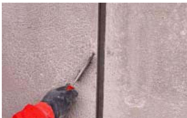
Preparation and cleaning of joint