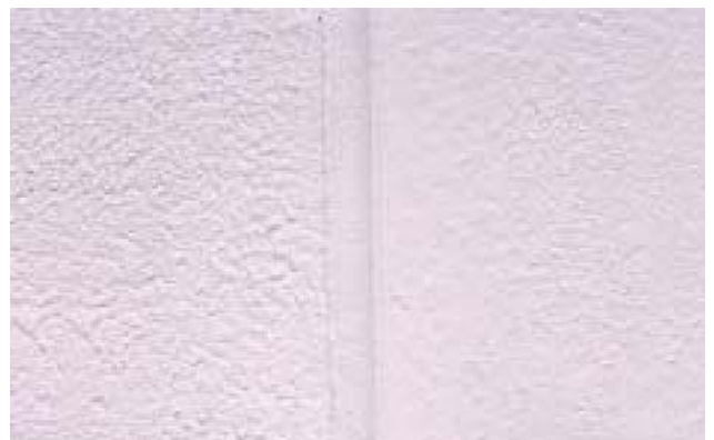
View of the finished joint. It can be painted with the desired colour

For any other issues, consult our Technical Department.