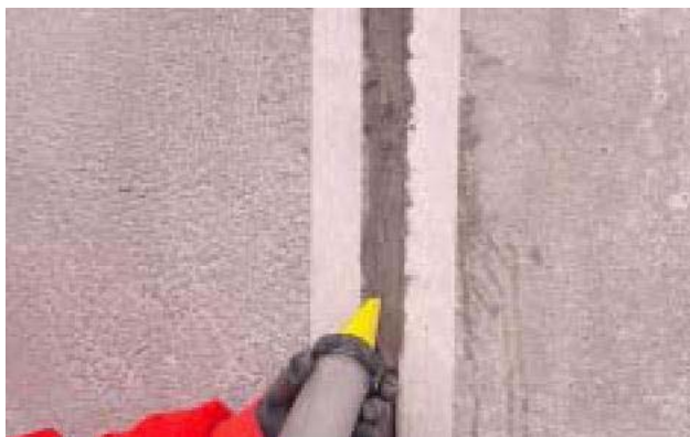
Application of MAXJOINT ELASTIC

Component A: NON toxic, NON flammable. It is not classified as dangerous material for transportation.