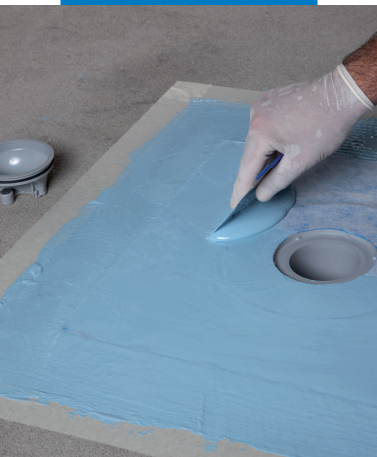
Impregnating Drain Vertical fabric with Mapelastick AquaDefense