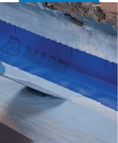
Application of Mapeband on a wall-floor fillet joint with Mapelastick AquaDefense