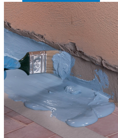
Application of Mapelastac AquaDefense by brush between floor and wall before applying Mapeband