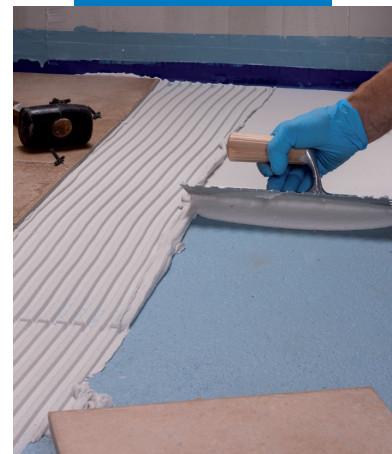
Bonding tiles on Mapelastac AquaDefense

Bond values according to EN 14891 measured using Mapelastac AquaDefense and a C2-type cementitious adhesive according to EN 12004