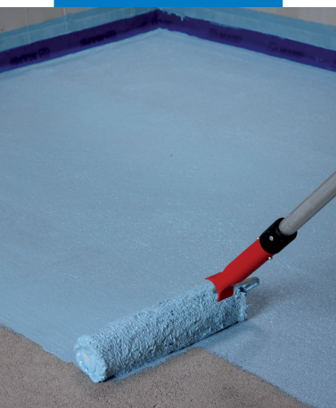
Application of the first coat of Mapelastick AquaDefense on a screed

Tiles installed on Mapelastick AquaDefense by using C2F-class MAPEI adhesives (such as Keraquick Maxi S1 or Granirapid .) and grouted with Ultracolor Plus may be opened to pedestrian traffic within 12 hours of starting the work.