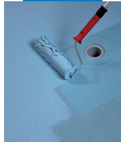
Application by roller of Mapelastac AquaDefense second coat